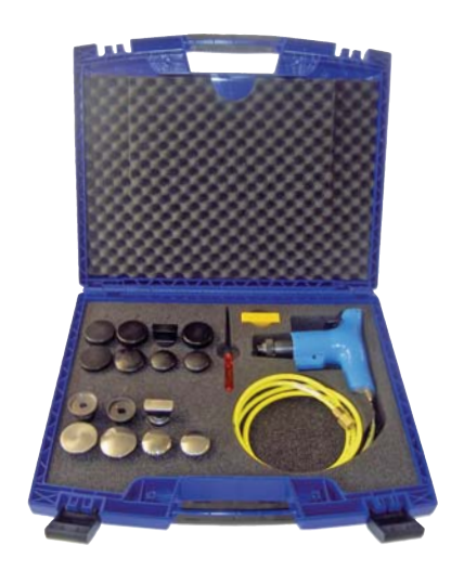
GL2 Deluxe - $2,605.00

The Eckold HF100 series handformer is a stationary machine with a manual drive that replaces laborious hammer work when forming metal. It is suitable for shrinking and stretching metal sheets and profiles up to a thickness of 1.5 mm (16 gauge). The single stroke of the handformer makes it possible to operate tools for notching, punching and edging. The HF100K includes one set of FWA405SSP Shrinking and FWR407SSP Stretching Jaws. The HF100PA100K is equipped with a pneumatic drive and foot pedal which allows for hands free operation. Also includes: FWA405SSP and FWR407SSP. Additional tooling available. View instructional videos at www.KlassicToolCrib.com.